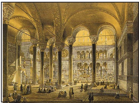
THE LIBRARY OF CONSTANTINOPLE