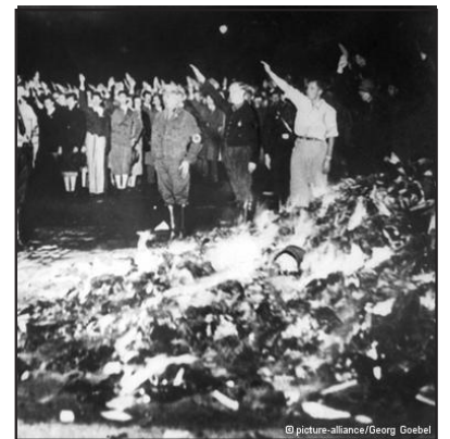
HITLER'S BOOK BURNING