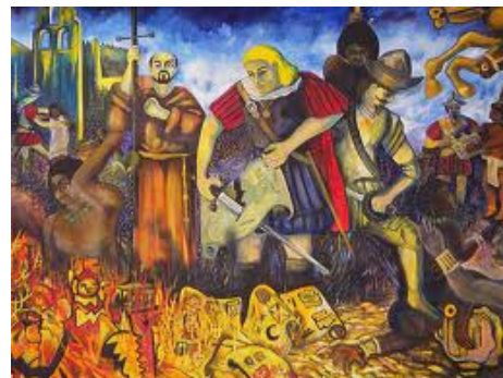
BURNING MAYAN BOOKS