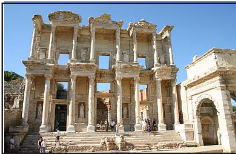
THE LIBRARY OF EPHEBUS