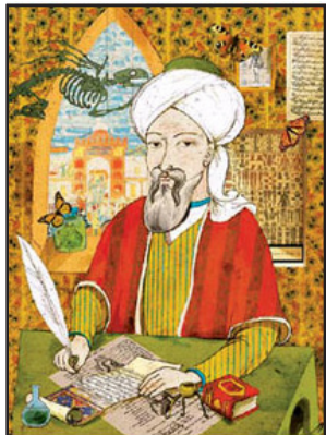
THE LIBRARY OF CORDOBA